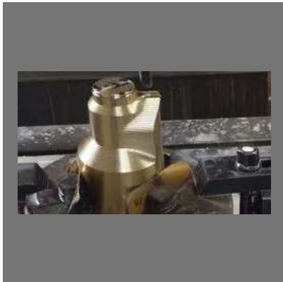
Stainless Steel VMC Job Works