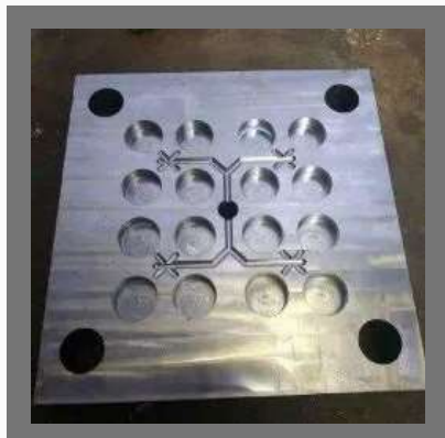
CNC Aluminum VMC Machine Job Works