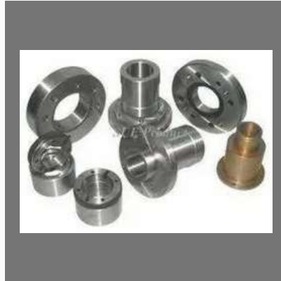
CNC Milling Job Works