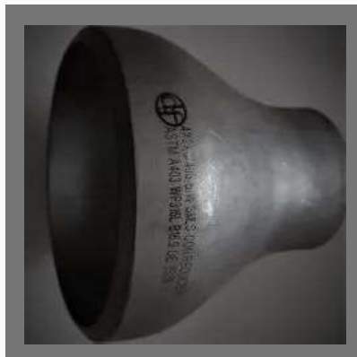
Laser Marking Service