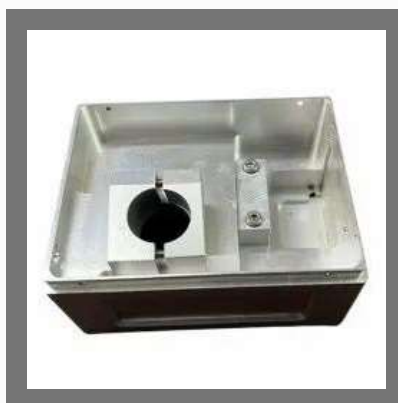
VMC Machine Part