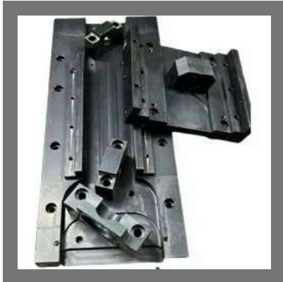
Diamond Machinery Mfg Co