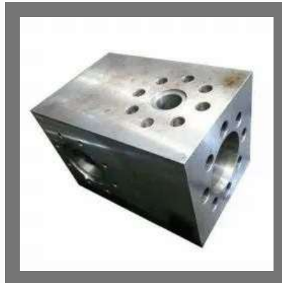
VMC Machined Components Job Work