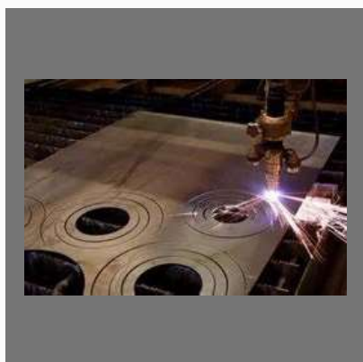
Laser Cutting Job Work