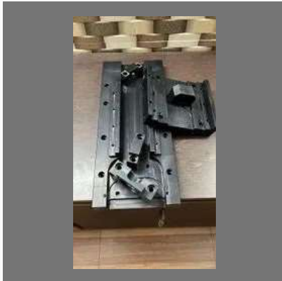
Dimanad Machine Axis Manufacturer