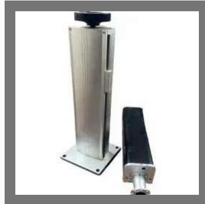
marking machine axis manufacturing