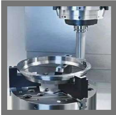
VMC Precision Work Service